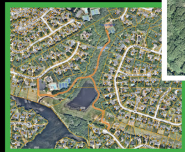
WATERFORD PARK Playground location

The City of Dunwoody has called for a voter referendum on the November 7, 2023 ballot to fund capital projects in whole or part by the issuance of general obligation bonds. Some projects are being considered for funding should the referendum be approved by the voters. The City reserves the right to modify plans and/or projects based upon the needs of the city and future funding.