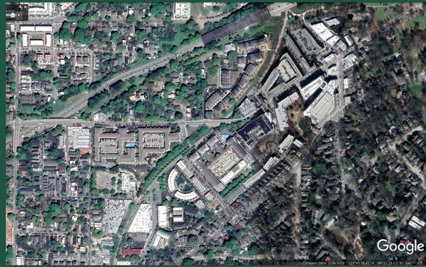
BeltLine corridor, 2020