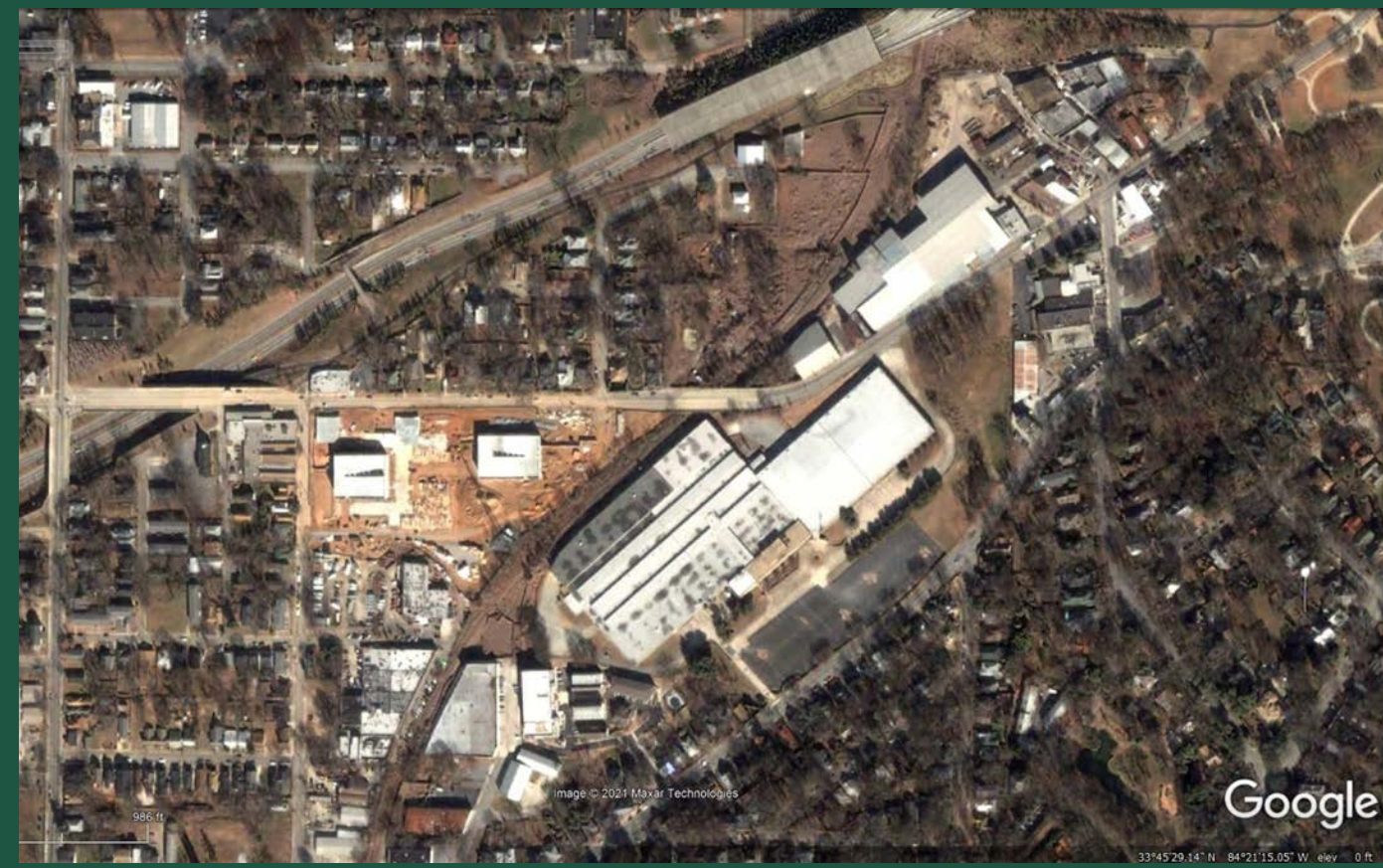
BeltLine corridor, 2004