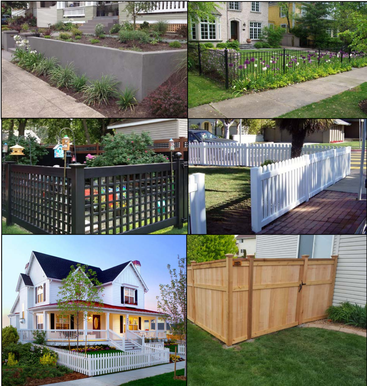
Figure 15-2: Examples of Permissible Fence Types